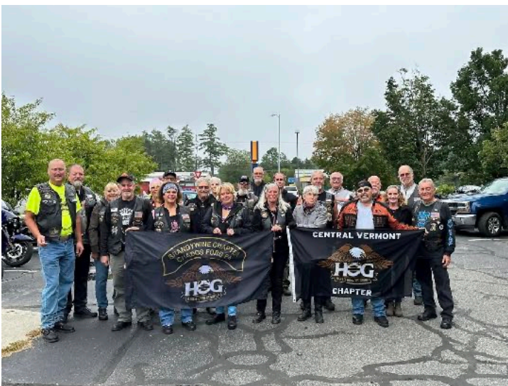
A group of riders from Central VT HOG joined us on Saturday morning for a day-long ride.

Several of our members went to Milwaukee to take part in the 120 th anniversary celebration of Harley-Davidson. Some have enjoyed other celebrations in previous years, and some were first timers, it is apparent that those who attended really enjoyed their time out there and they brought back some great photos to share with the rest of us on our HOG Facebook page.