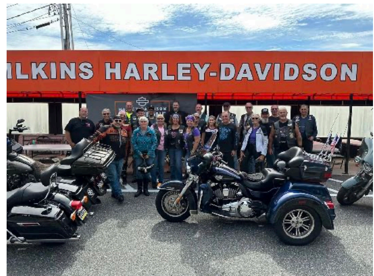
Along the route we stopped at Wilkins H-D in South Barre, VT for fun festivities at the dealership's Open House.