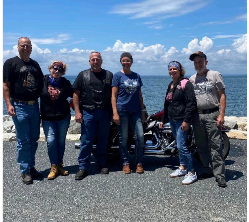
At the waterfront on Tilghman Island.