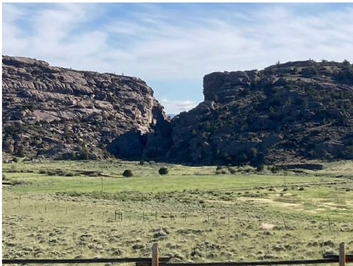
Devil's Gate in Wyoming.

Writing for the newsletter is all new to me and has been at many times a daunting challenge. However it helps me tell my story. So, what's your story? I encourage you to take some time and tell us about your experiences. New to group riding? Getting back to riding after a break? Have been riding many for years? How long have you been riding? What type of bike(s)? Is there favorite road or place you been to? What are some of your best rides or trips? You can offer advice on how to make plans or other ideas that have worked for you. Let's share our stories in the newsletter.