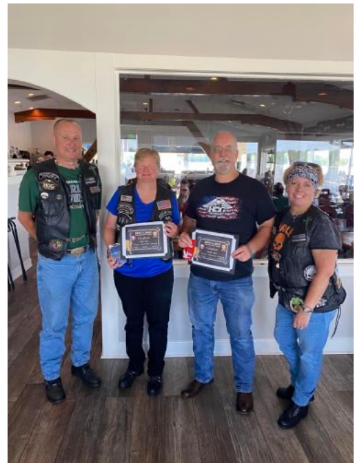
Scavenger Hunt winners were recognized at the anniversary luncheon.