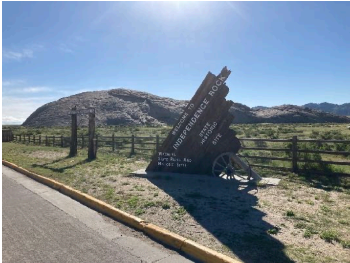
Marker at Independence Rock.