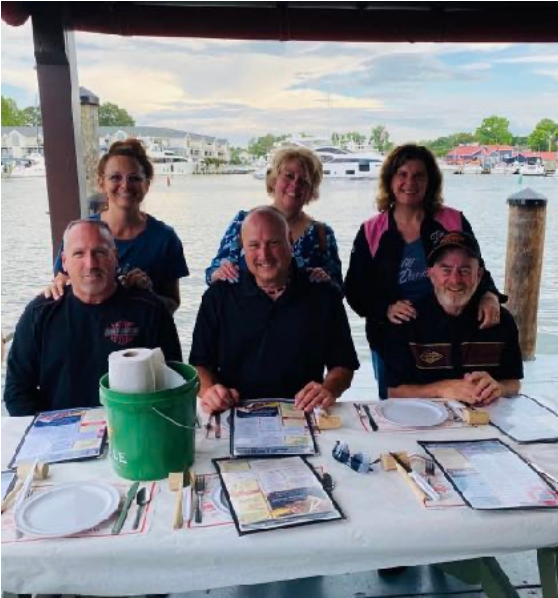
Dinner at the Crab Claw.