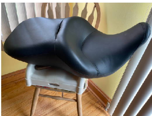
Sundowner Super Reach

Seats for sale. First is a Sundowner Super Reach seat, like new, fits 2014 Street Glide and newer touring bike. Asking price is $240.00. Also available is a single rider seat, for a Dyna Low Rider, fits 2006 or newer. Asking price is $100.00. Call or text Ben F. at (610) 721-3525.