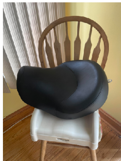
Single rider seat